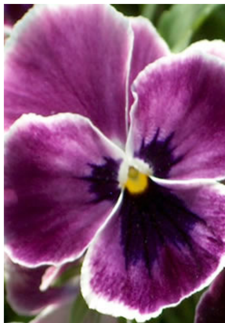
Plant pansies this autumn.

Join the conversation. Engage with our experts. Ask a question. Tell us about your garden, or just keep abreast of gardening happenings?