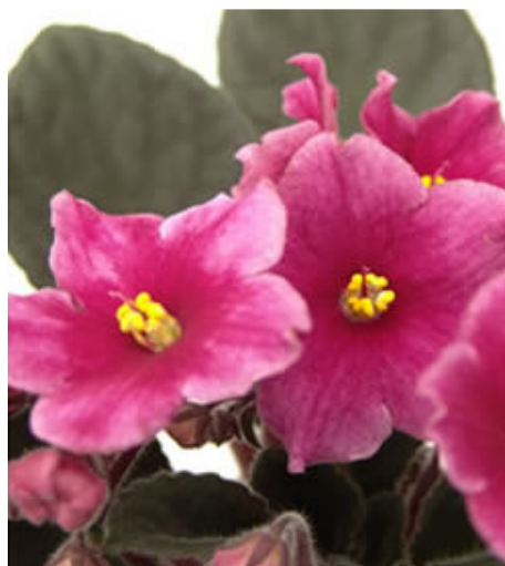
African violets. Green gifts for Mother's Day.