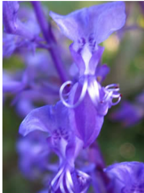
Plant autumn-flowering plectranthus