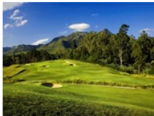
GEORGE - R350 000

Prime plot as re-sale on Kingswood Golf Estate for sale. Urgent sale reduced - Excellent position, best views and an excellent position to build your dream home on this prime newly developed Golf Estate and Golf Course