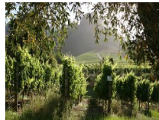
FRANSCHHOEK - R15 900 000

This property is a portion of a well-established wine and guest estate. The farm has a small vineyard and olive grove and is ready to be further developed. Beautiful views overlooking the Franschhoek mountains. Ideal to build an exclusive residence.