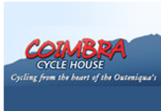
Comibra Cycle House