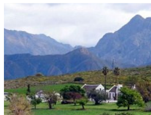
WORCESTER - R5 995 000

Historic farm set on the slopes of the Langeberg. The self-catering cottages have all fully equipped kitchens, patios and gardens. 35 Ha of the farm is arable for crops. The field of oat hay, organic vegetable garden and paddocks are under irrigation. There are two 4 x 4 routes offering spectacular views as well as easily accessible and numerous walking and hiking trails for the exclusive use of the guests. Going concern.