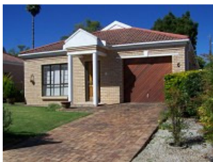
GEORGE - R799 000

Spacious townhouse in sought after complex. Open plan lounge, dining area and kitchen, separate laundry, patio, 2 bedrooms, 2 bathrooms and garage.