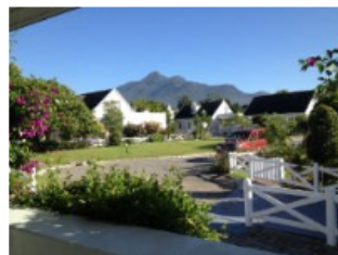
GEORGE - R899 000