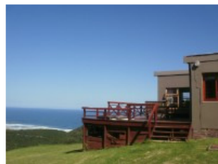
WILDERNESS - R3 200 000

Jacuzzi with Solar Heating panels, big swimming pool, outside Cellar; 100sqm Workshop; Wendy House. Already