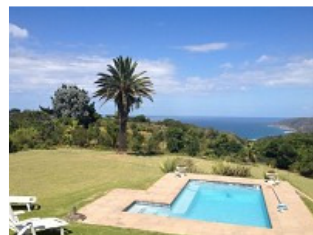
WILDERNESS - R4 500 000

Jacuzzi with Solar Heating panels, big swimming pool, outside Cellar; 100sqm Workshop; Wendy House. Already